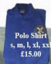
Polo Shirt s, m, l, xl, xxl £15.00