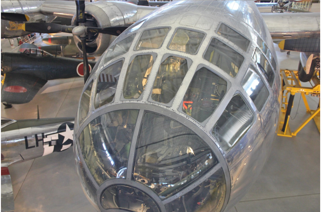
Moving on over the central gantry the first thing that hits your eye is the Enola Gay, the actual one that dropped the first atomic bomb. This is in pristine con-