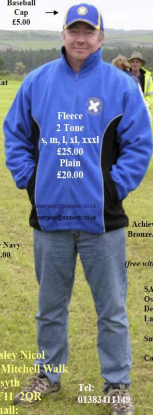
Fleece 2 Tone s, m, l, xl, xxxl £25.00 Plain £20.00