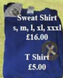
Sweat Shirt s, m, l, xl, xxxl £16.00